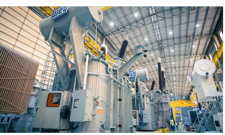
WEG Transformers USA manufactured several 45-ton transformers for Ameren Missouri's Smart Energy Plan and has announced plans to expand into a 3rd factory in Washington, boosting its total employment to over 500.